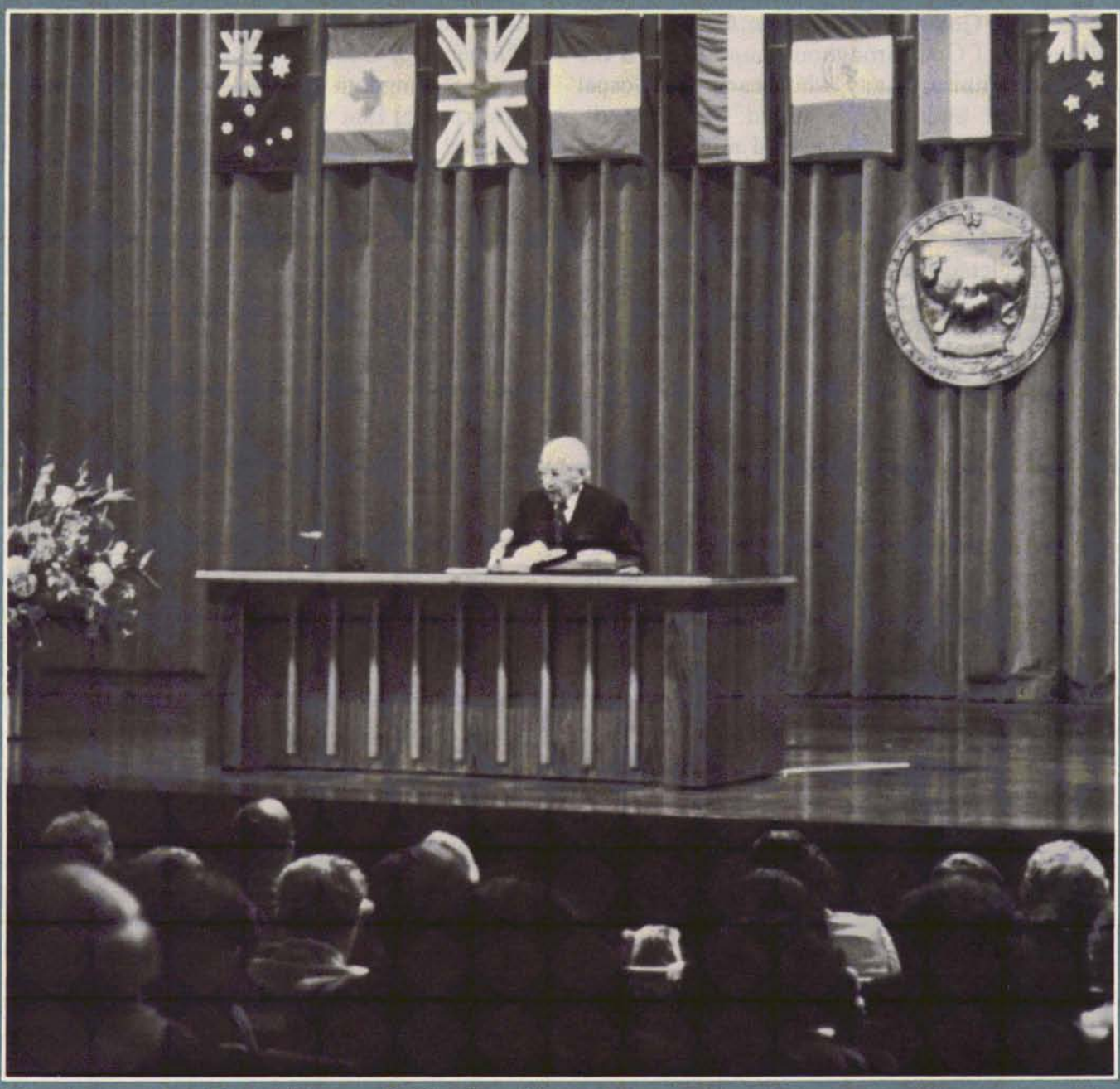
Fundamental Doctrines of God's Church