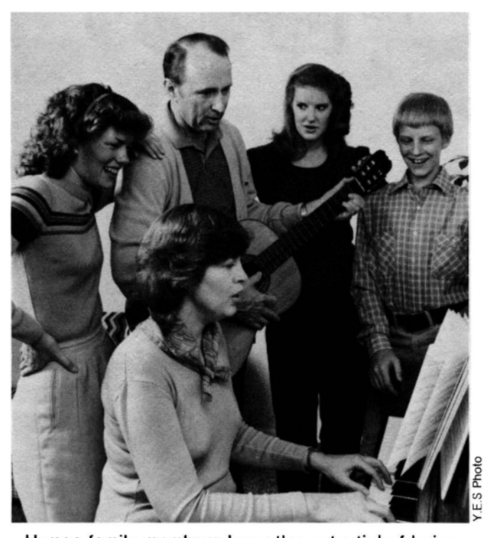
Human family members have the potential of being born into the Kingdom or Family of God.