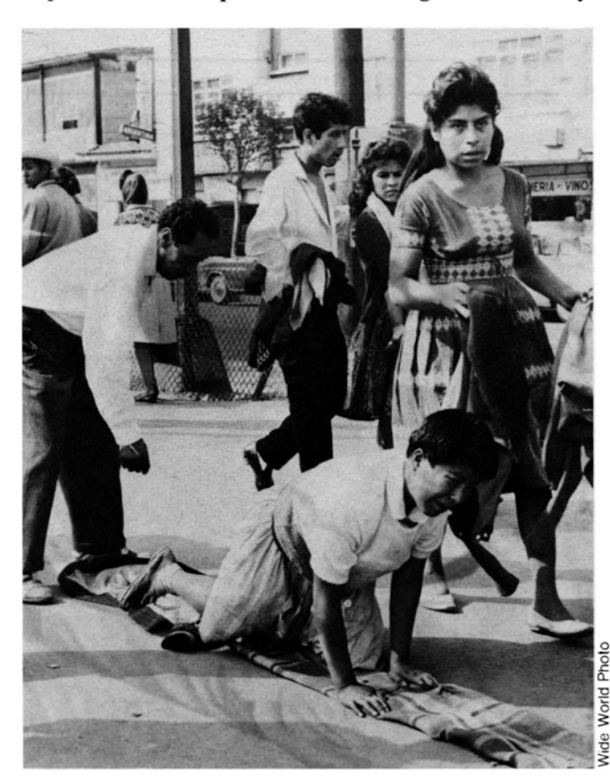
No amount of penance or human works can bring about God's forgiveness of sin.

True repentance is not a temporary sorrow for sin. It is something much deeper. Godly repentance is a permanent change in the way